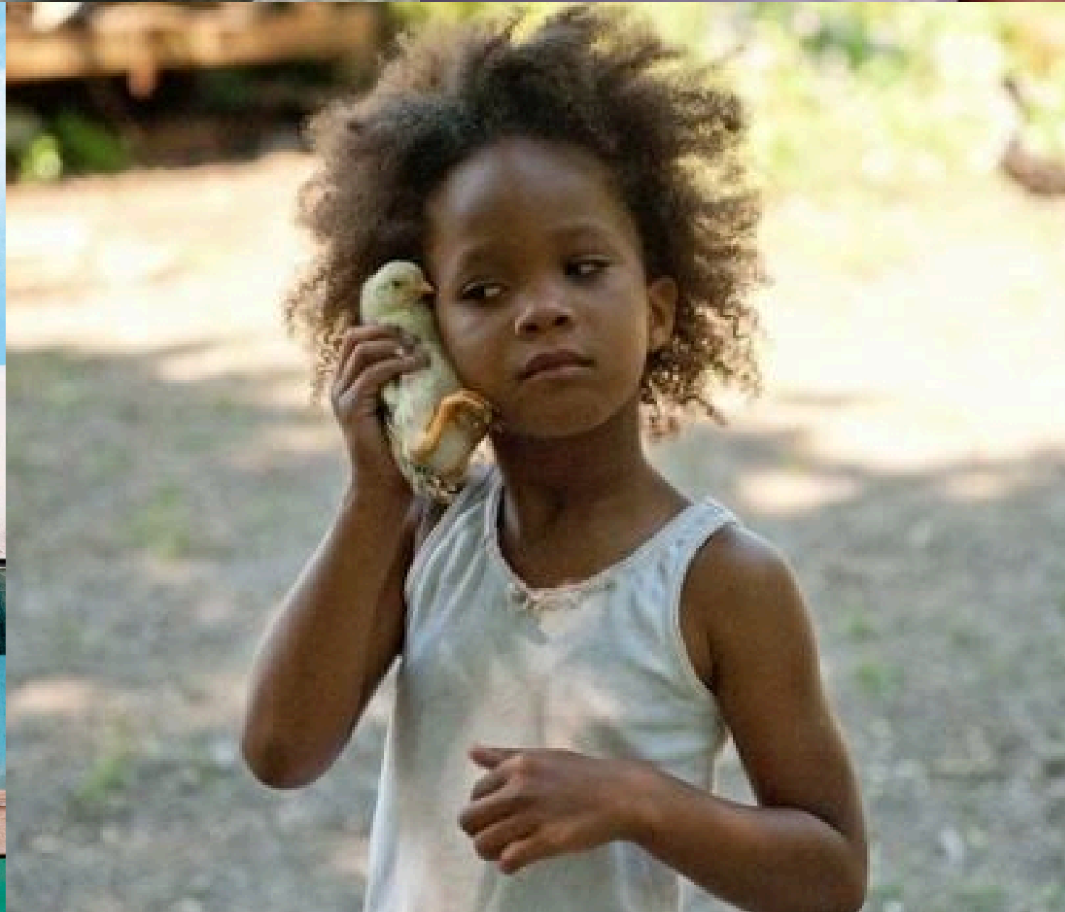
BEAST OF THE SOUTHERN WILD