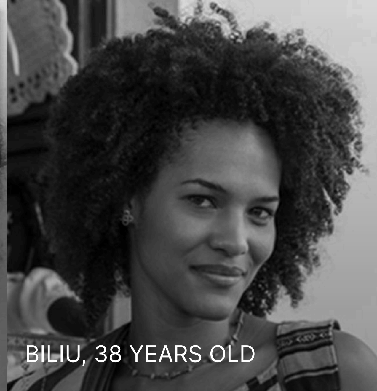
BILIU, 38 YEARS OLD