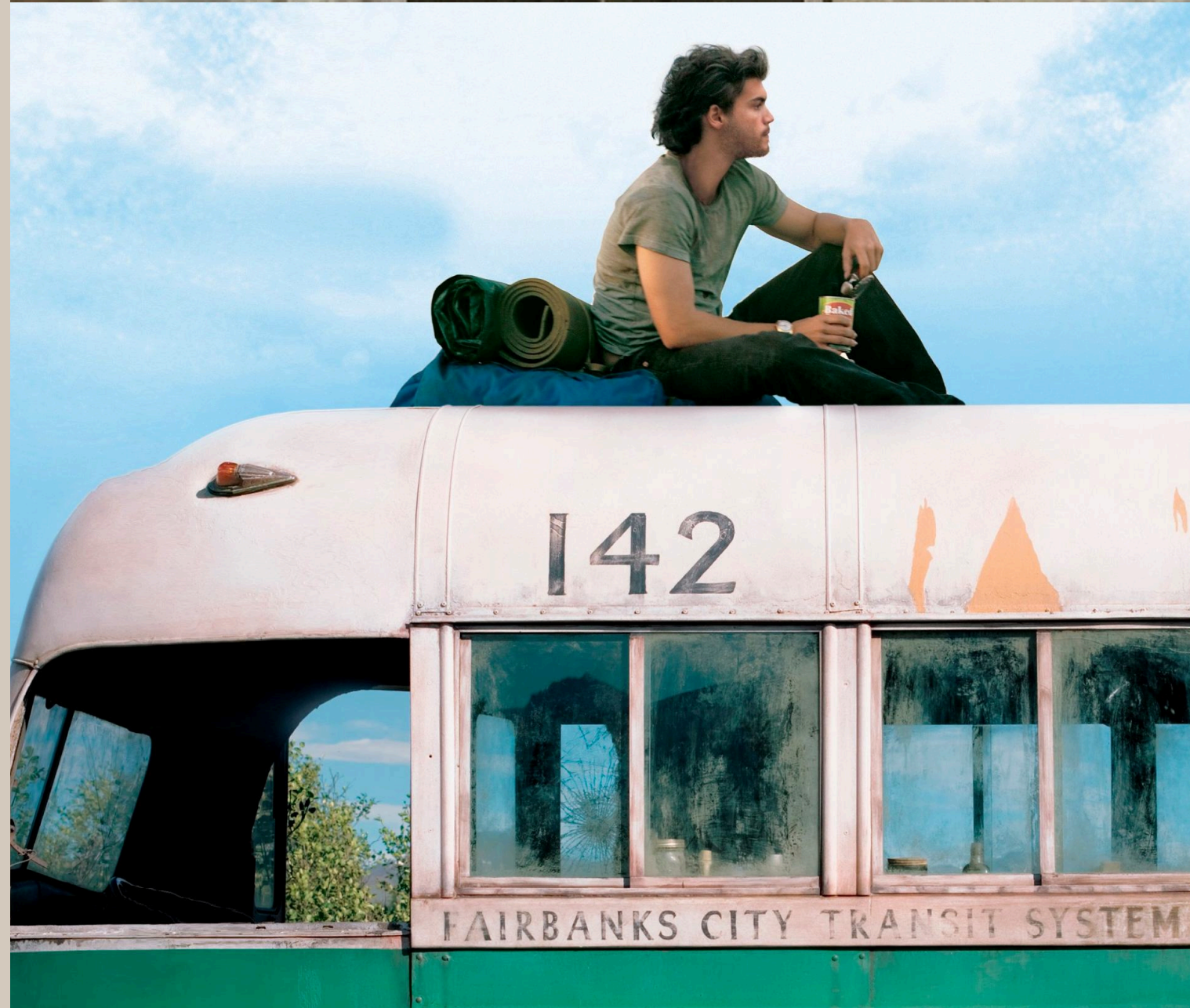
INTO THE WILD