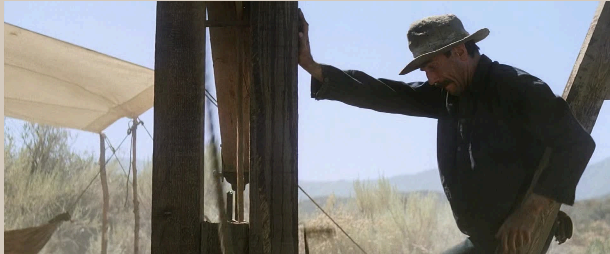
THERE WILL BE BLOOD