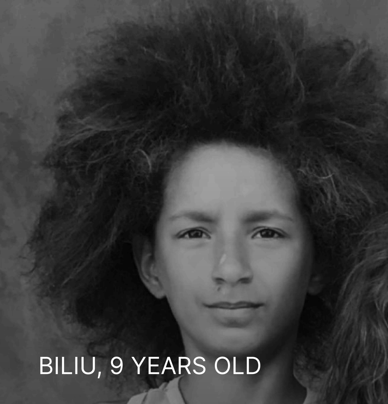
BILIU, 9 YEARS OLD