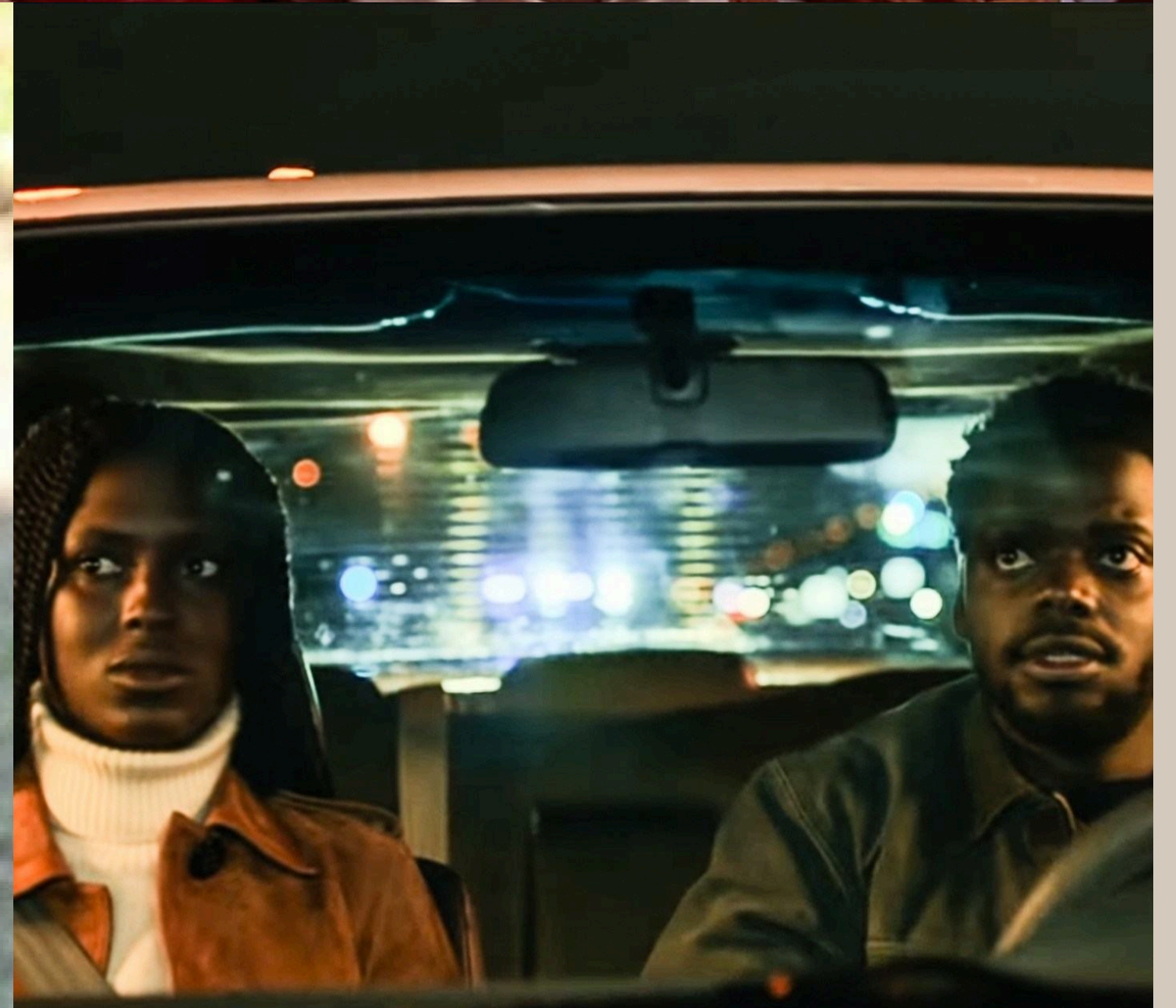
QUEEN & SLIM